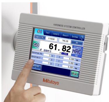
HR-530, HR-530L, HR-610A & HR-620A Touchscreen Controller