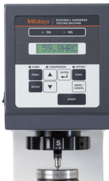
HR-320MS, HR-430MR, HR-430MS Interface