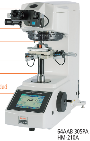
64AAB 305PA HM-210A

MeasurLink ENABLED Data Management Software by Mitutoyo