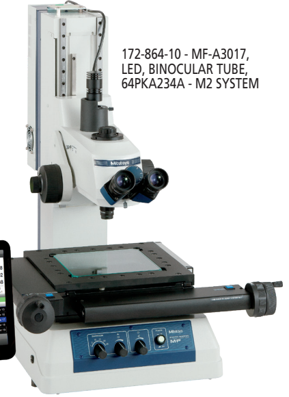
172-864-10 - MF-A3017, LED, BINOCULAR TUBE, 64PKA234A - M2 SYSTEM