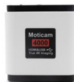
Camera with software for digital viewing