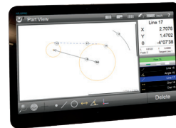
176-872-10 MF-UA2010 - with 64PKA234A M2 Software/Hardware