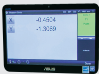
64PKA-M2-MF M2 Retrofit Kit for MF/MF-U Microscopes