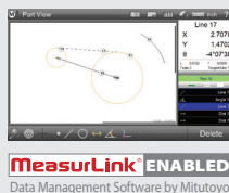
MeasurLink ENABLED Data Management Software by Mitutoyo

M2 is a universal 2D coordinate measurement software which has become the preferred software for many optical comparator users due to its intuitive user interface and data collection procedures.